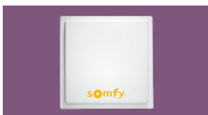
UHF RFID Reader

WHAT DO WE PROVIDE YOU: Complete ready to use tried and tested solution. Rover Long Range UHF Readers, Controllers, Boom Barrier / Turnstiles and Software Solution for MIS Reporting. SDK is also available for integration with your existing applications.